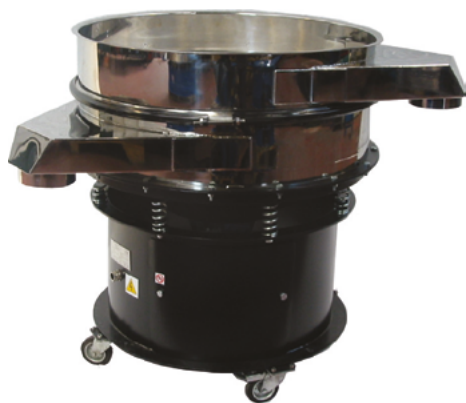
- Mirror-polished finishing